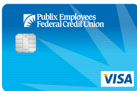
VISA Debit Card Standard Design