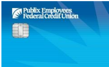
Standard Visa Debit Card Design

Feel free to contact our Card Services Department with any questions or comments, by calling toll-free 1-800-226-6673, ext. 6602 or sending us an email at cardservices@pefcu.com .