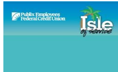
Standard ATM Card Design